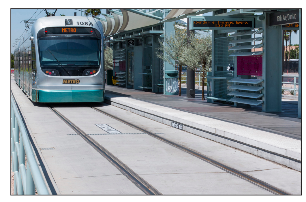
TekWay ADA Domes with Bull-Nose on Light-Rail Platform

TekWay High Performance ADA Domes for Mass Transit Applications are available in various Natural colors (White, Yellow, Charcoal, Terracotta Red, Brown, Green and Light Gray) and Authentic Federal Standard 595 Colors* (Yellow, White, Black, Blue, Red, Orange, and Gray). * All FED-STD-595 Colors are available, Specify requested number upon ordering